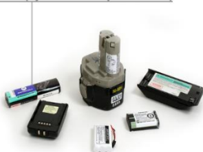
Ni-MH (Hydruure métallique de nickel)