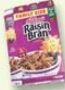
Paper and Frozen Food Boxes