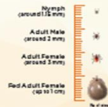
Illustration by: (source) by the artist, reproduced by the artist in 2010 PHOTO: JIM COOPER - GETTY IMAGES / GLOBE PHOTOS PHOTO: JIM COOPER - GETTY IMAGES / GLOBE PHOTOS

Feel for bumps and look for tiny dark spots . Look carefully, most ticks are very small!