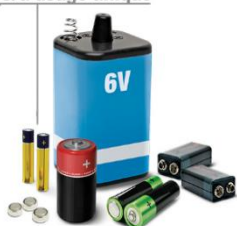
Primaires/à usage unique

Primary/one-time use cells and batteries. Alkaline batteries, with lithium, silver oxide, zinc-air, zinc, carbon and zinc chloride, better known as AA, AAA, 9V and D batteries, and button batteries, are all primary type batteries.