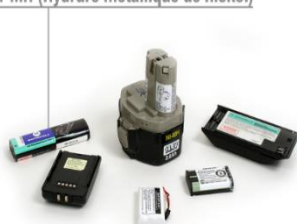
Ni-MH (Hydruure métallique de nickel)