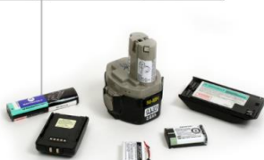
Ni-MH (Hydrure métallique de nickel)