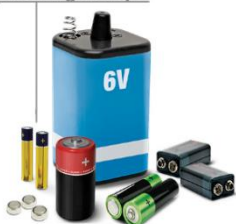
Primaires/à usage unique

Primary/one-time use cells and batteries. Alkaline batteries, with lithium, silver oxide, zinc-air, zinc, carbon and zinc chloride, better known as AA, AAA, 9V and D batteries, and button batteries, are all primary type batteries.