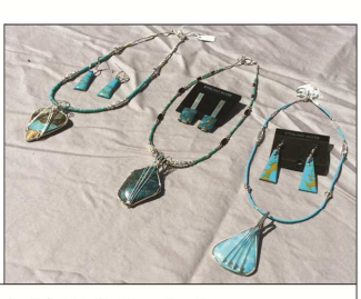
Hélène Cliche & Jacques Campbell | 24 juillet* au 6 août