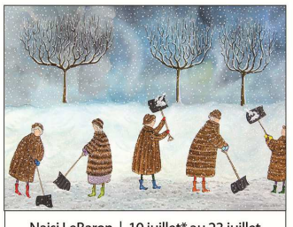
Naisi LeBaron | 10 juillet* au 23 juillet