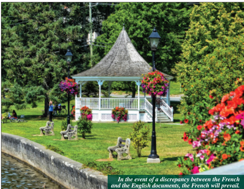
In the event of a discrepancy between the French and the English documents, the French will prevail.