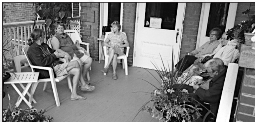
The Porch Dollies make one of their regular evening visits with residents of the Connaught Home.

The Porch Dollies, a small group of local volunteers, can be found almost every evening on the front porch of the Connaught Home. The Dollies have graciously devoted their time to the residents living at the Home by spending quality time amongst them, whether it be for cards, tea, or chitchat. The Porch Dollies have also taken upon themselves to tend to the flower boxes and gardens on the property, a stunning display of both dedication and care. The Connaught Home would like to express their deepest gratitude to their friends, The Porch Dollies, for all their loving efforts and continued commitment to the Home and its residents.