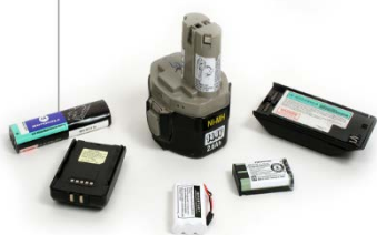
Ni-MH (Hydruure métallique de nickel)

The nickel-metal hydride battery is high performance for energy-efficient appliances and can be recharged up to 1,000 times. It contains no cadmium but can be costly.