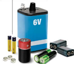
Primaires/à usage unique

Primary/one-time use cells and batteries cannot be recharged and have to be discarded once they run out.